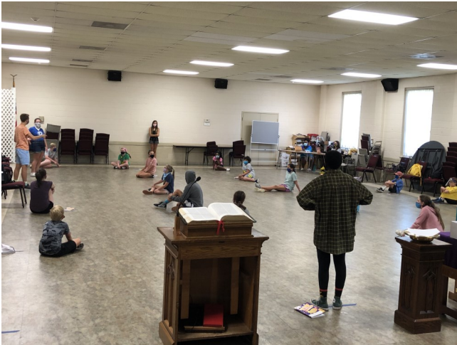
Running lines in the sanctuary while social distancing. All singing and dancing was rehearsed outside under the shade trees on Evergreen.

Trinity's resident youth theatre group, New Spark Performing Arts, hasn't let the pandemic slow them down (much). In June, they had a virtual talent show and people voted by making donations online. In July, with the permission of the Trinity Board of Trustees, they held a Willy Wonka summer camp for kids aged 8 – 13. For more information about their safety procedures, visit their website https://www.newspark901.org/covid-19.html .