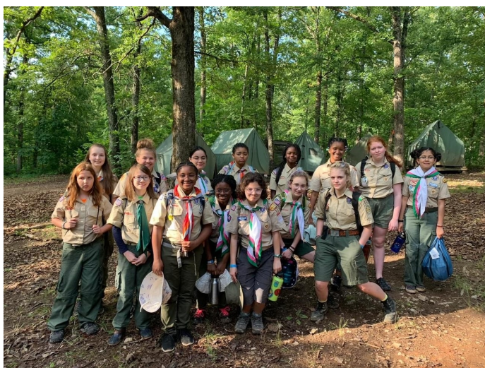
Scout Troop 13G