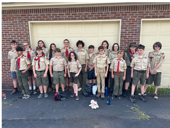
Scout Troop 13B