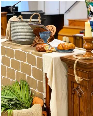
Maundy Thursday Altarscape