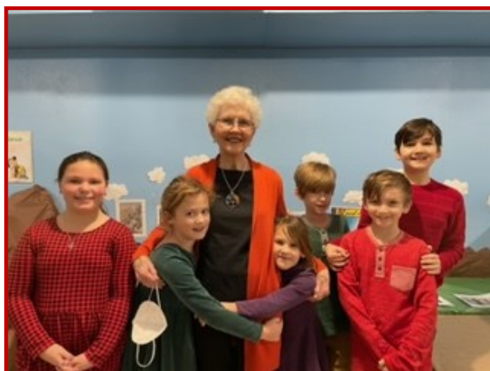
Just look how our children have grown!

(Please let us know if we left off a birthday or if a date is incorrect. We will make that correction in our next issue of Trinotes and in our records.)