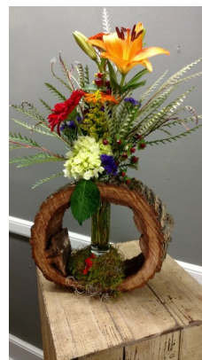
Floral Centerpiece by Rachel's Kids, Inc. Wooden crosses & trees also available

Then shop from these and other artisans: