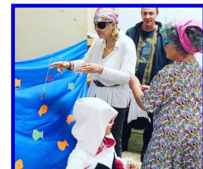
A few photos from "Trunk or Treat." (Article on page 6)