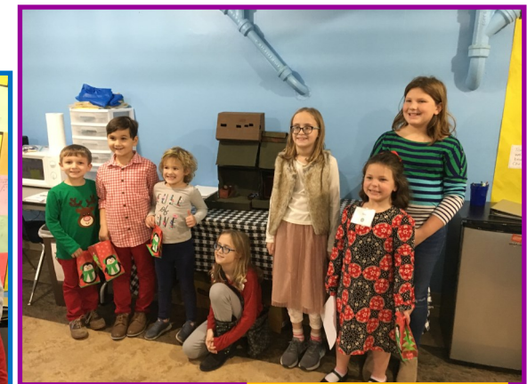
The Children's Sunday School class pauses to pose for a group picture. They do know how to have fun and learn, too!