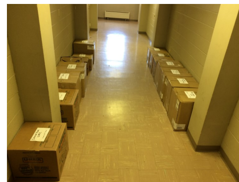
Fifteen boxes of socks going to other Room in the Inn sites.

We could never use this many socks in our Trinity clothes closet, so we are sharing them with 16 other Room in the Inn-Memphis locations. That way all our unsheltered guests can get the socks they need. As a little “thank you” to Bombas, I ordered four pairs of socks. They are expensive, but I think they might be the most comfortable socks I have ever worn. I will be buying more soon. I encourage you to do the same. They definitely follow through on their pledge to help those in need.